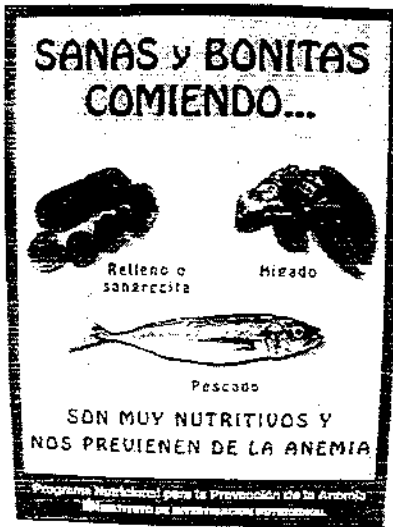
Poster featuring iron rich foods