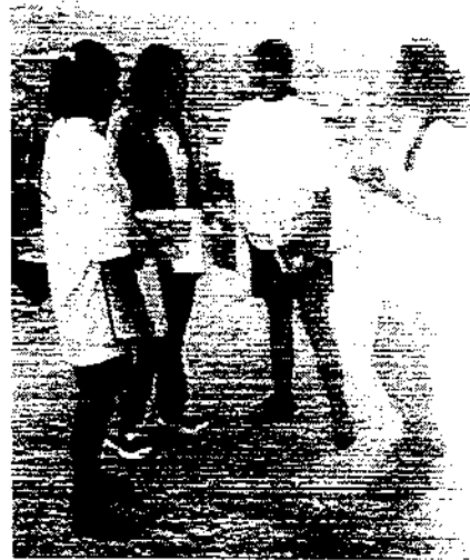
Adolescent girls with IEC materials from anemia intervention